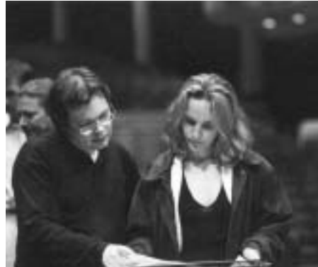
Héléne Grimaud, featured soloist of the RNO's Winter 2004 tour, and conductor Alexander Vedernikov in rehearsal with the orchestra

RNO] has become a living symbol of the best in Russian art amid the uncertainty and joy of creating democracy in Russia."